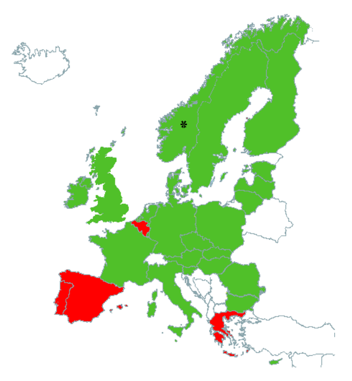
Figure 2^7 : State of adoption of the RBMPs: GREEN - adopted. RED – Not adopted or partially adopted.

In Belgium, the Flemish Region, the Brussels-Capital Region and the Federal Government (responsible for coastal waters) have adopted plans; the plans for the Walloon Region are awaited. In Spain, the RBMPs of Tinto Odiel y Piedras, Guadalete y Barbate and Cuencas Mediterraneas Andaluzas have been approved but not reported and only the plan for the river basin district of Catalonia has been adopted and reported. In Portugal and Greece no plans have yet been adopted or reported.<sup>6</sup>